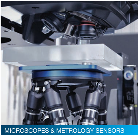
MICROSCOPES & METROLOGY SENSORS